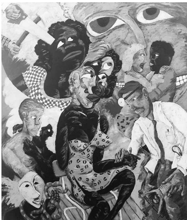
19. Grandma and the Frenchman (Identity Crisis) (1990) by Robert Colescott.

And doesn't the expression of personal identity demand an imposed narrative and a realist mode?