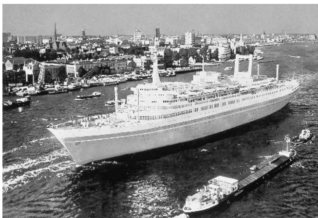
7. SS Amsterdam in Front of Rotterdam (1966) by Malcolm Morley. Is this just a big ship, or a statement about the nature of art?

Many modernist works aimed at a kind of self-explanatory autonomy (‘all you need to understand’ Four Quartets , in particular,